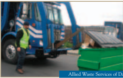
Allied Waste Services of Daly City

Presorted Standard U.S. Postage PAID San Mateo, CA Permit No. 610